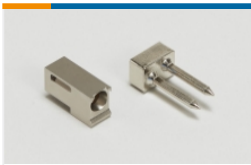
Backplane Guide Hardware(4)